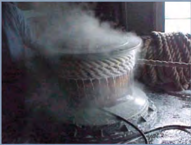
Powertec motors and drives power the Warp Winch Drive on the USS Roosevelt.

When the USS Roosevelt (The Big Stick) was deployed to the Middle East, we were there.