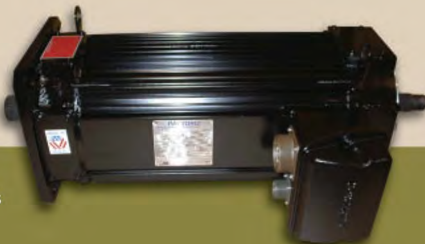
Advanced Gun System – one of five axis drives