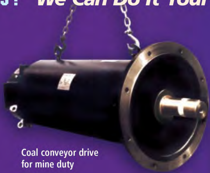
Coal conveyor drive for mine duty

From the Antarctic to the Atlantic Ocean, from outer space to deep in a mine or from an explosive atmosphere to no atmosphere, Powertec motors and drives are on the job. Chances are, if you have a difficult application in a severe environment... we've already been there. And if we haven't, we'd love to go there with you!