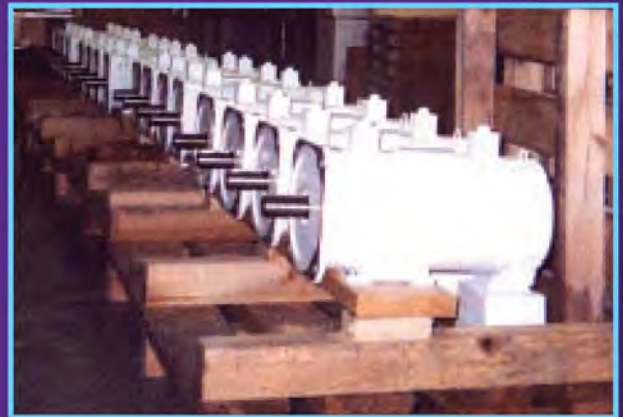
On-deck ocean going duty, fiber optic cable laying application.