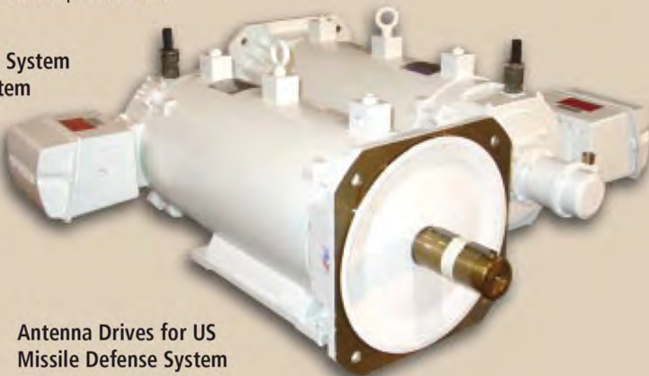
Antenna Drives for US Missile Defense System